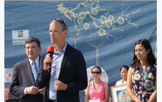
主辦方人員準備中 Members of organizers are preparing