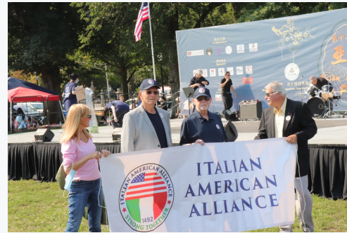
參與遊行嘉年華的部分團體 Some organizations at the celebration parade