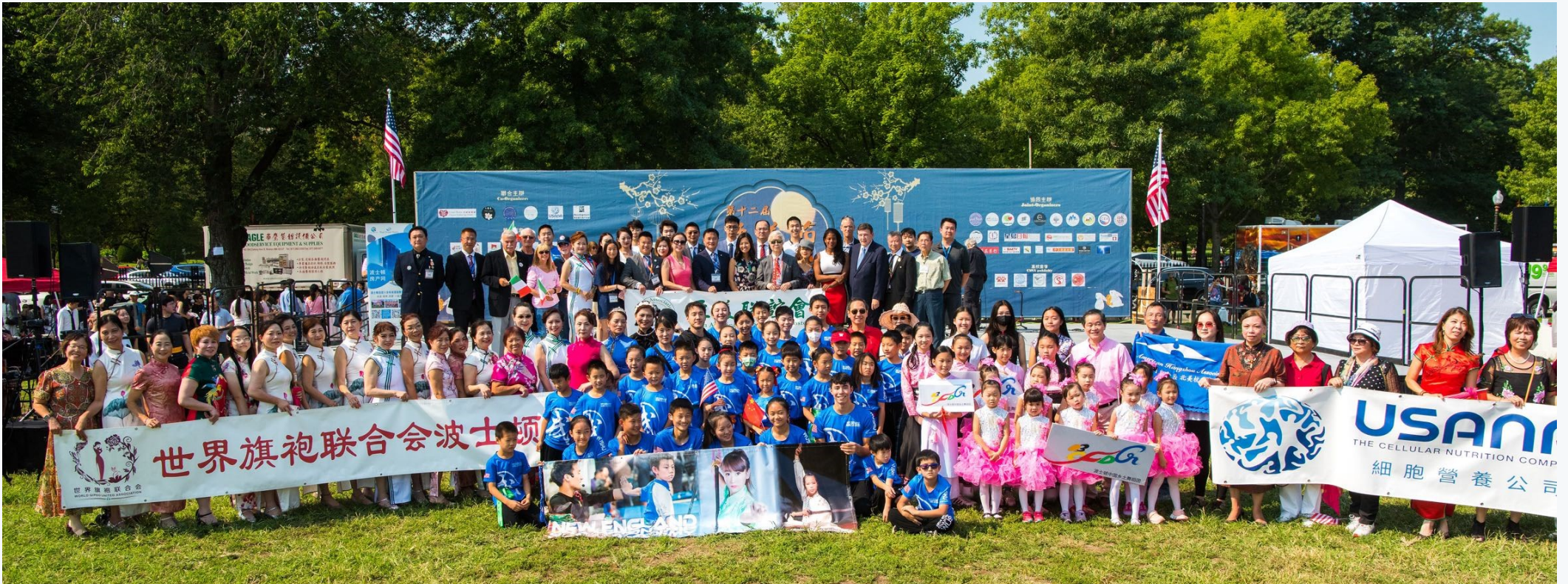
第十二屆亞美節主辦方及部分團體合影 Group photo of the organizers of the 12th Asian American Festival and parts of joined groups

The photos of 12th AADay Festival Part 1