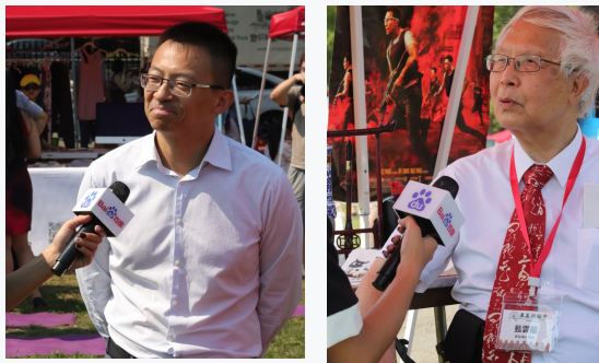
百度網記者採訪亞美節合作商家、主辦方 Reporter from Baidu interviewed our business partners and organizers

The open-air meeting place in the park in downtown Boston, with an usable area of 200,000ft 2 (approximately 17,800m 2 ). The center of the venue is equipped with a 40*30ft open-air stage with a background board, and a professional audio team provides round-the-clock service for corresponding cooperative businesses to give speeches and publicity at the opening ceremony. There are 65-90 10*10ft tents on site, which can be used by merchant booths. On-site planning of a single booth can reach a maximum of 40*10ft. At the same time, we also provide catering businesses with power supplies and fire protection permit applications, which can be applied to us before August 10, 2023.