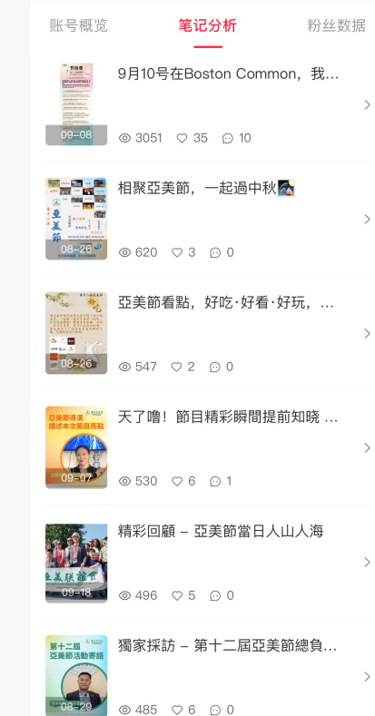
第十二屆亞美節現場特刊 The 12th AADay Festival Guide book