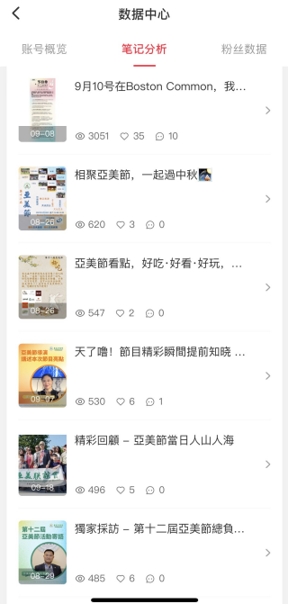
Views of RedBook APP account during the 12th AADay Festival