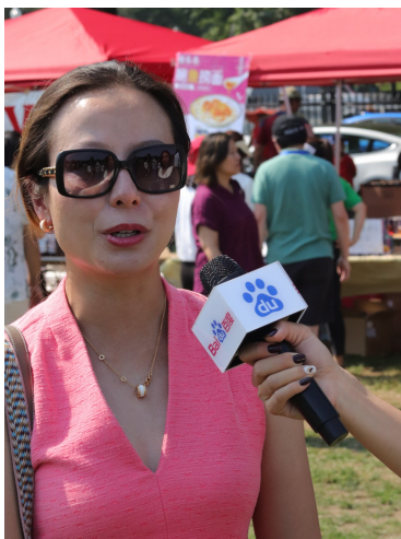
Reporter from Baidu interviewed our business partners and organizers