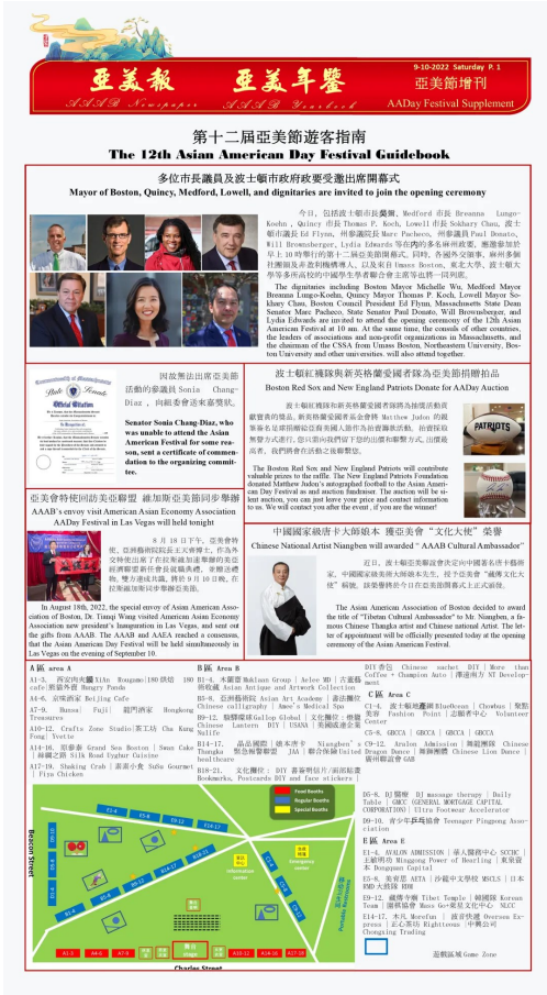
The 12th AADay Festival Guide book

At the event site of the Asian American Festival, we will distribute to all visitors the "Asian American Press On-Site Special Issue" that can be used as a guidebook (more than 5,000 copies of the online and paper editions will be released in 2023). According to the level of sponsorship, all merchants can obtain a page of corresponding size for their own promotional advertisements. At the same time, the WeChat public account platform of the Asian American Club (an article pushed by the event can reach more than 500 views per article), the account of RedBook (an article pushed by the event can reach more than 500 views per article), and platforms such as Facebook and Twitter will all be synchronized Push the advertisement or promotional video of the corresponding cooperative merchant.